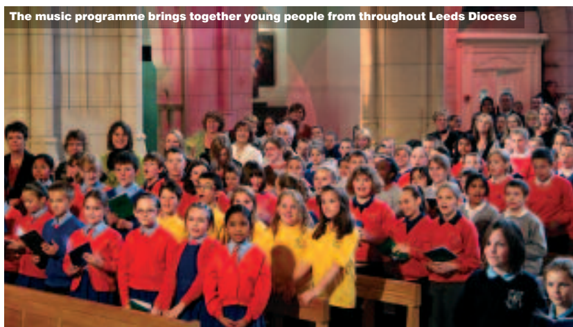
The music programme brings together young people from throughout Leeds Diocese