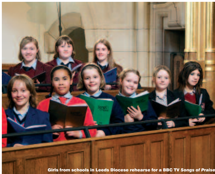
Girls from schools in Leeds Diocese rehearse for a BBC TV Songs of Praise

Throughout the schools support for the programme was unequivocal. As one teacher put it: 'The children in our primary school are benefiting from high-standard cathedral training'. A complementary view was that of Mgr McQuinn, Vicar