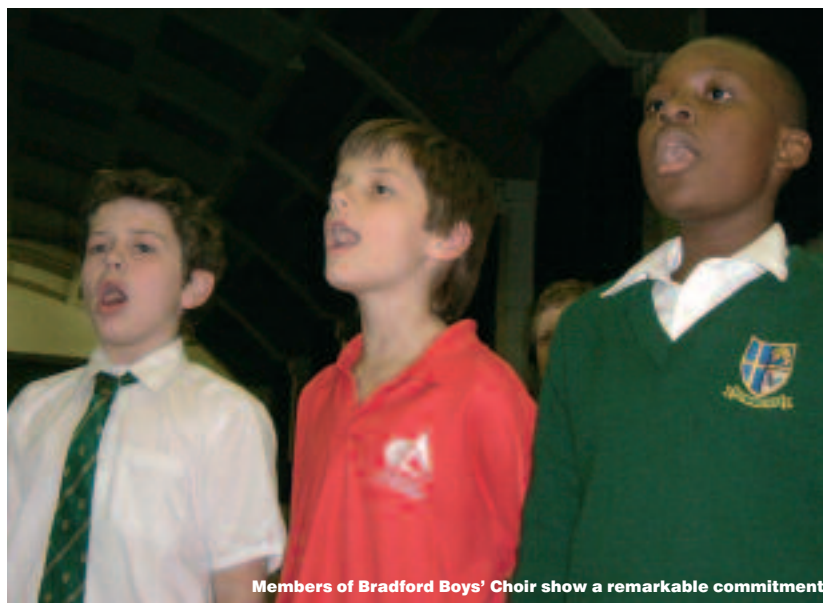
Members of Bradford Boys' Choir show a remarkable commitment